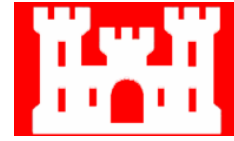
Army Engineer Corps