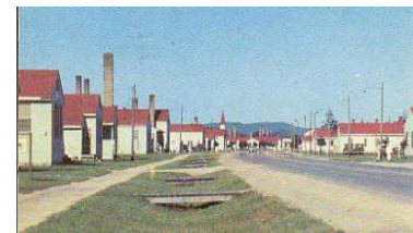
Camp McCoy – 1950s