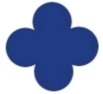
88 th Division