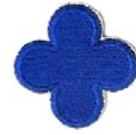
88 th Infantry Division