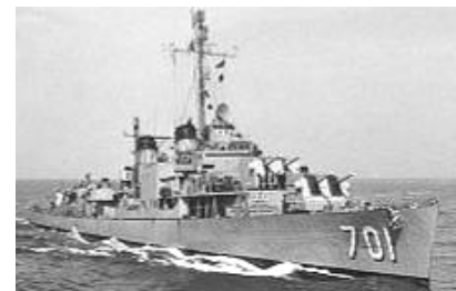
USS John W. Weeks (DD-701)