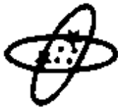
Electronics Technician Insignia