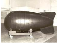
Mark 6 Mod 0 A-Bomb Case