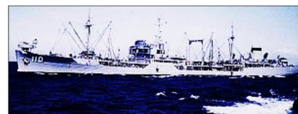
USS Dithmarschen (IX-301)