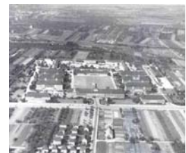
7th U.S. Army Headquarters Stuttgart, Germany