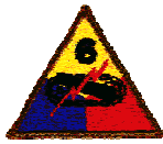
6th Armored Division