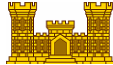
U.S. Army Engineer Corps