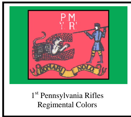
1 st Pennsylvania Rifles Regimental Colors