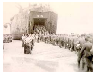
Arthur (foreground of left line) watching German prisoners entering the tank deck of LST-315 to be taken back to England