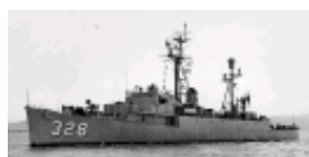
USS Finch (DE-328)