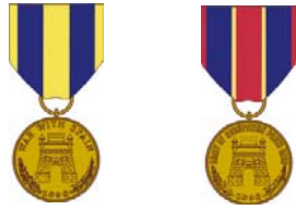
Spanish and Puerto Rico Occupation Medals