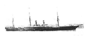
City of Chester