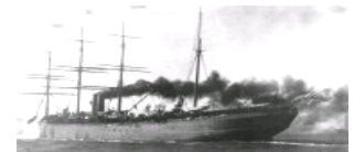
City of Washington