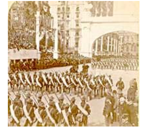
4 th Pennsylvania Regiment Philadelphia Peace Jubilee 27 October 1898