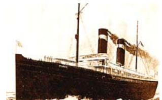
USS St. Louis