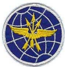
Military Air Transport Service