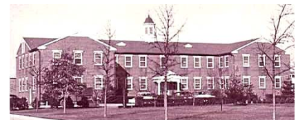
Valley Forge Hospital