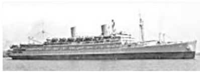
USS Mount Vernon (AP-22)