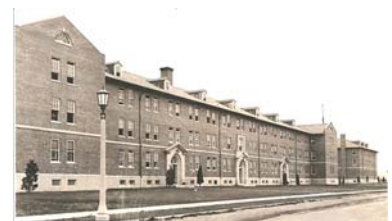
Ft. Lewis, Washington, Army Barracks, World War II