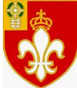
12 th Field Artillery Regiment