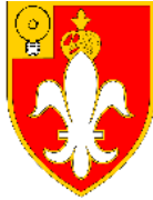
1 st Battalion, 12 th Field Artillery Regiment