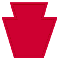
28th Infantry Division Patch