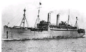
USAT George Washington