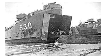
LST-530 beached at White Beach, Lingayen Gulf, Philippine Islands, July 1945