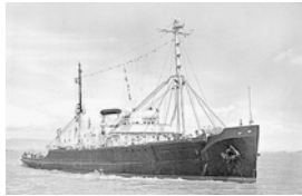
USS Seize (ARS-26)