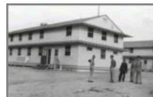
Fort Jackson Barracks World War II Era