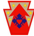
213 th Regional Support Group Pennsylvania National Guard