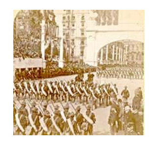
4<sup>th</sup> Pennsylvania Regiment Philadelphia Peace Jubilee 27 October 1898