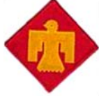
45 th Infantry