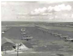
Ascension Island Airfield – 1941