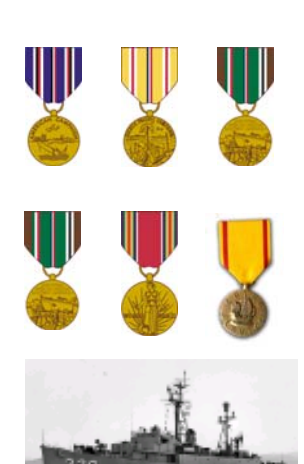
USS Finch (DE-328)