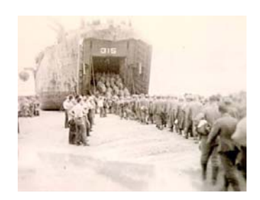
Arthur (foreground of left line) watching German prisoners entering the tank deck of LST-315 to be taken back to England